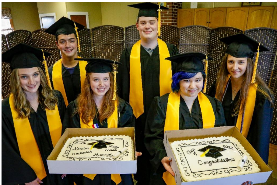
Cornerstone seniors celebrate on graduation day – June 3rd