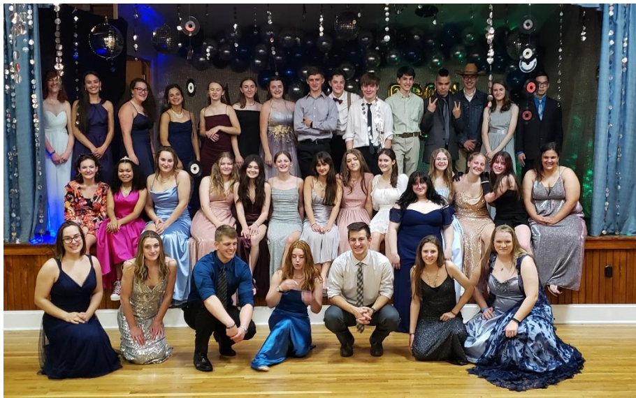
“Disco Fever” – 2022 Prom – May 20th