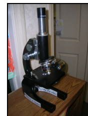
T.E.A.C.H. Microscope for loan with deposit.

There is a two week sign out period. The supplies will soon be available for check out during the C.L.A.S.S. Day hours which are Mondays until 4:30 pm.. Currently, they are housed at the Children's Preservation Library on Hastings Street. Enjoy!